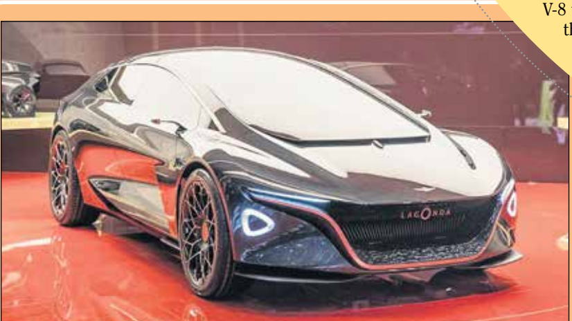
Aston Martin Lagonda says its new Lagonda electric vehicle will stay true to the Vision concept (below) that was first shown in 2018.

It's exciting to hear that an all-new model is on the way from Fiat Chrysler's Italy-based division. Based on a recently displayed concept, the Alfa Romeo Tonale (named for a mountain pass in Italy) is similar in style to the brand's Stelvio tall wagon, but is quite a bit smaller in size (think BMW X1 or Audi Q3). A turbocharged four-cylinder will be the primary powerplant, but the Tonale will also be available with a plug-in hybrid system. Although both front- and all-wheel-drive variants will be built, it's probable that AWD will be standard. Look for it early next year.