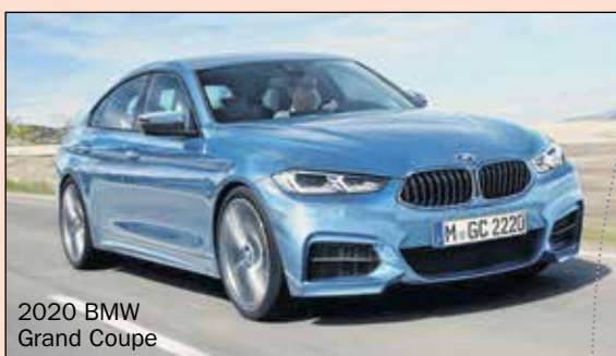
2020 BMW Grand Coupe