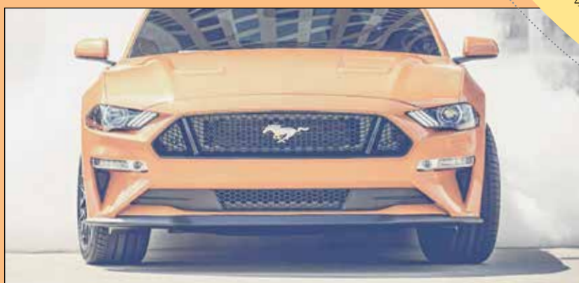
The 2020 Mustang 5.0 V-8 cranks out 480 horses. The next step down is the base 310-hp four-cylinder, but Ford is looking to lessen that power gap.

The Italian maker will unveil the 488 GTB's replacement this week at the Geneva Motor Show, which began on Thursday. The new Ferrari F8 Tributo will have a 3.9-liter V-8 engine making 710 hp and 568 lb-ft of torque, which tops the 488 GTB's by 49 horses and 17 lb-ft. Ferrari says the Tributo will be the most powerful V-8 production model it's ever sold. And fast? The Tributo will go from 0 to 62 mph in 2.9 seconds, with a top speed of 211 mph. Thank the lightening of the car, which is 88 pounds lighter than the 488 GTB, with a 10 percent improvement in aerodynamic efficiency. The S-Duct first seen on the 488 Pista has been redesigned to improve downforce by 15 percent more than the 488 GTB, and new brake cooling intakes up front improve airflow. The mid-rear engine Tributo will also be graced with a new version of the Ferrari Dynamic Enhancer, which helps control lateral dynamics in high-performance situations, and will now be able to activate in Race mode. For more racing effect, the steering wheel's rim has become smaller in diameter. MSRP is $276,550.