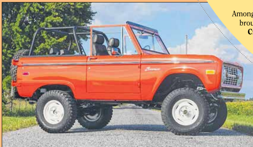
Gateway Bronco wants to sell you a brand new 1974 Ford Bronco.

Among the evolving hot categories is the midsize-pickup segment, practically launched when Ford brought the Ranger nameplate following a long absence. Hyundai teased truck buyers with a Santa Cruz small truck concept in 2015 and now sources say that it — or something quite similar — is definitely production-bound for the 2020 model year. What's more, corporate cousin Kia is expected to have its own pickup a year or two following the launch of the new Hyundai. The Santa Cruz is expected to stick with the sport-truck theme, which means it will come only in extended-cab format, while Kia's version would use the same platform but likely have totally different look. Both trucks would share the same powertrains that would likely include turbocharged four-cylinder and hybrid drive systems.