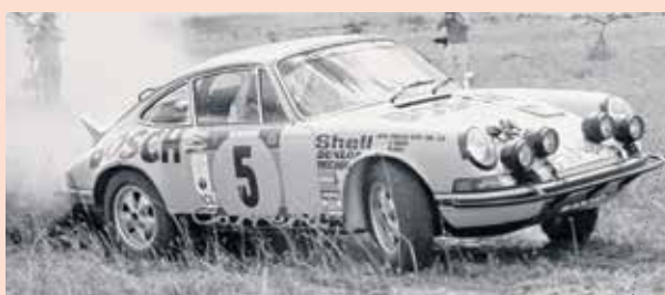
A modified Porsche 911 runs the 1973 East Africa Safari