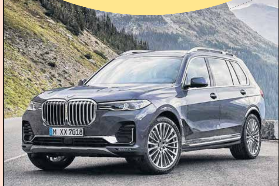
The upcoming BMW X7 will be larger than the Mercedes-Benz GLS, but smaller than the Cadillac Escalade and the Lincoln Navigator.

Ford's off-road ready Raptor pickup only made us hungry for more, and has us asking: What if instead of being based on the fullsize F-150, Ford were to give us a trail-hungry truck one size down? That would fill out the line-up, for sure, but despite sightings of what appears to be a Raptor off-road version of the midsize 2019 Ranger pickup, reports are that such an model/trim level will not be sold in North America. Instead, it's destined for the automaker's dealerships in Europe, Asia, South America and Australia. That Ranger Raptor will likely be powered by a fourcylinder turbo-diesel and not a gasoline engine that was speculated to be used for the potential North America version. One reason being touted for restricting the junior Raptor's availability is that the projected list price would have been too high, relative to the current F-150-based Raptor. As well, the turbodiesel is deemed to be not powerful enough for North American truck aficionados.