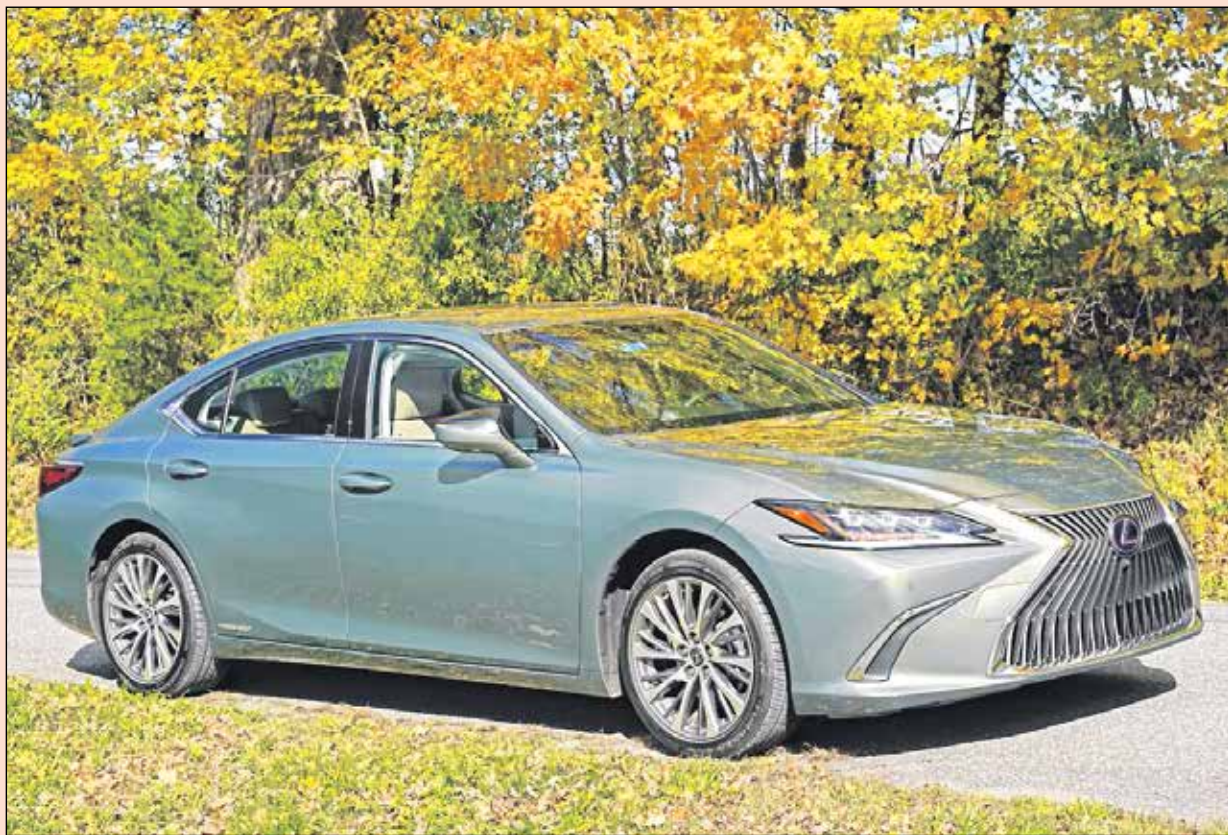
LONGER, LOWER AND WIDER FOR 2019, the Lexus ES 300h's hybrid drive system combines a 2.5L Atkinson-cycle four-cylinder gas engine (left) with a 29.1kW electric motor, for a combined system output of 215 horsepower.