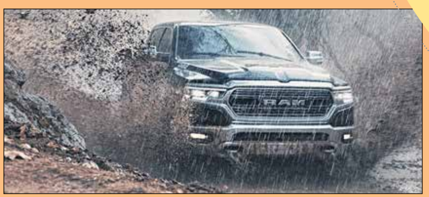
This Ram truck Superbowl ad was widely condemned as tasteless and tone deaf.