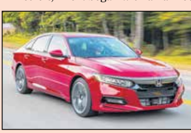
2018 Honda Accord

The 2018 North American International Auto Show (NAIAS) in Detroit, Mich. began with an announcement that the Honda