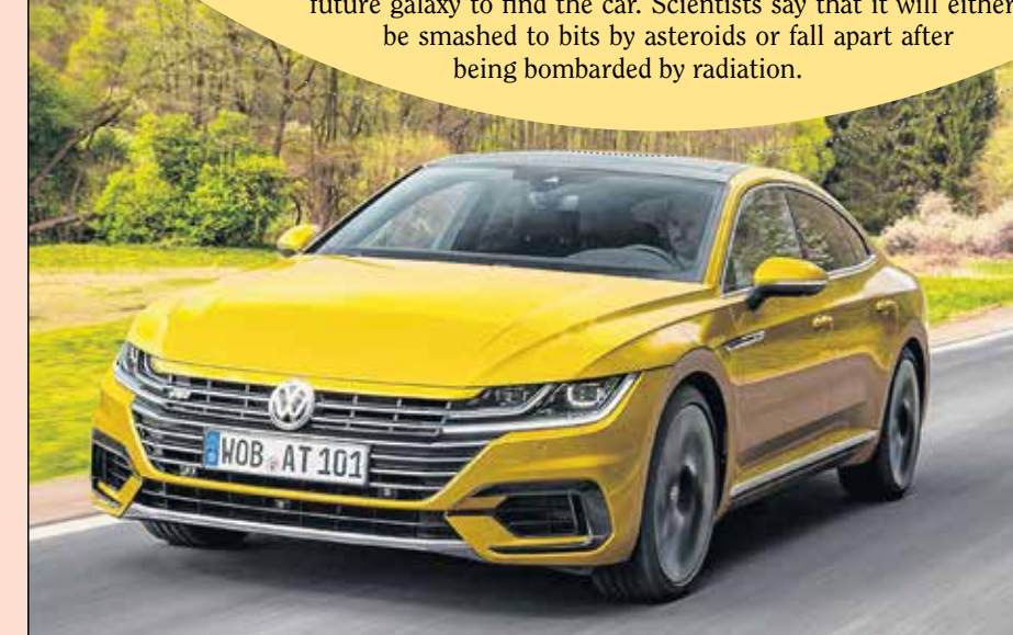
The new Volkswagen Arteon could receive a twin-turbocharged V-6 worth about 400 hp.

Tesla Roadster heading off into space were livecast back to Earth. The test of what is now the world's most powerful rocket was successful, with its reusable boosters making it back to Earth safely. Starman and his Tesla will keep traveling, however. Intended for Mars, they overshot their trajectory and are now headed for the asteroid belt. But don't expect aliens in some distant future galaxy to find the car. Scientists say that it will either be smashed to bits by asteroids or fall apart after being bombarded by radiation.