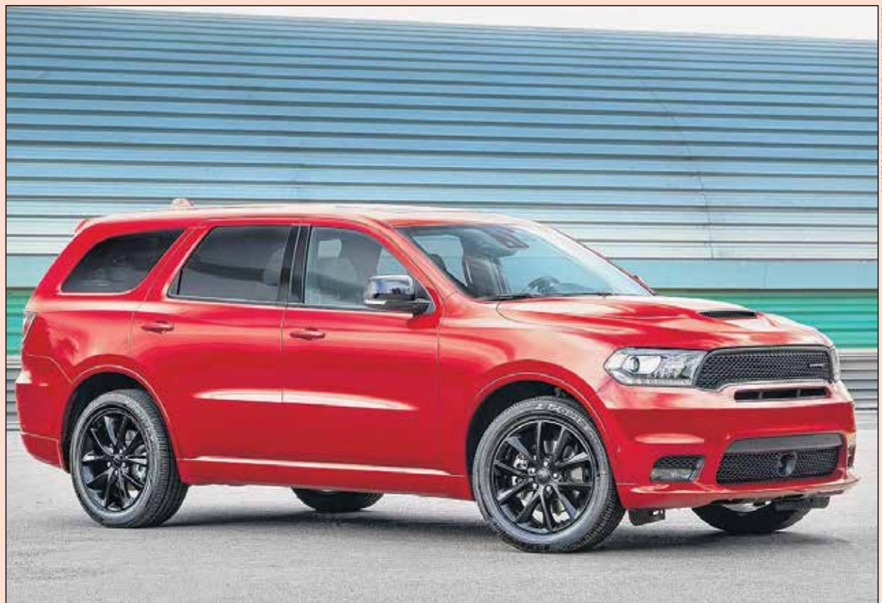
THE 2018 DURANGO is Dodge's full-sized SUV, and a muscular one at that. The Durango R/T comes with a 6.4L Hemi that produces 475 horsepower. Lower trim levels offer a 3.6L V-6 as standard, with an optional 5.7L Hemi V-8.

I've driven Durangos extensively with both the six and the 5.7 Hemi under the hood. The six has enough power to please the majority of drivers. The 5.7 Hemi is about "more." If you enjoy the feeling of extra capacity under foot, like a rumbling exhaust note and/or want added towing capacity, the Hemi will suit you best. New this year, R/T models share the SRT's hood (with functional air inlet) and front fascia/lower valence (with cold air duct and LED fog lamps).