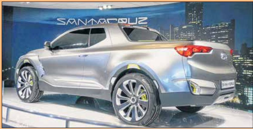
This 2015 Santa Cruz concept might become the basis for Hyundai's first pickup.

There are also new, yet-to-be-named car-based tall wagons in the works. Equally important, Hyundai will increase the number of models equipped with turbo-diesel, plug-in hybrid and electric drivetrains. The company will also dabble in hydrogen-powered models.