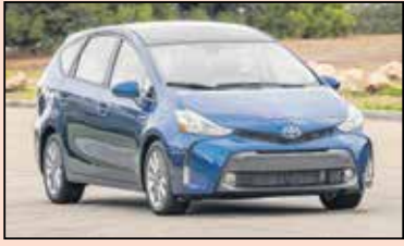
2017 Toyota Prius v

Toyota's dedicated gasoline-electric hybrid vehicle lineup (it's members are not converted gasoline models) is the most successful of its type in the world. Sources say, however, that the next-generation Prius v will grow in size when it launches for the 2019 model year, becoming more of a tall wagon than the current version. Building the Prius v on Toyota's latest multi-use platform means