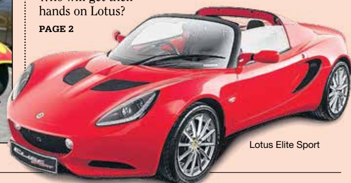
Lotus Elite Sport

The area's most complete automotive resource and listings.