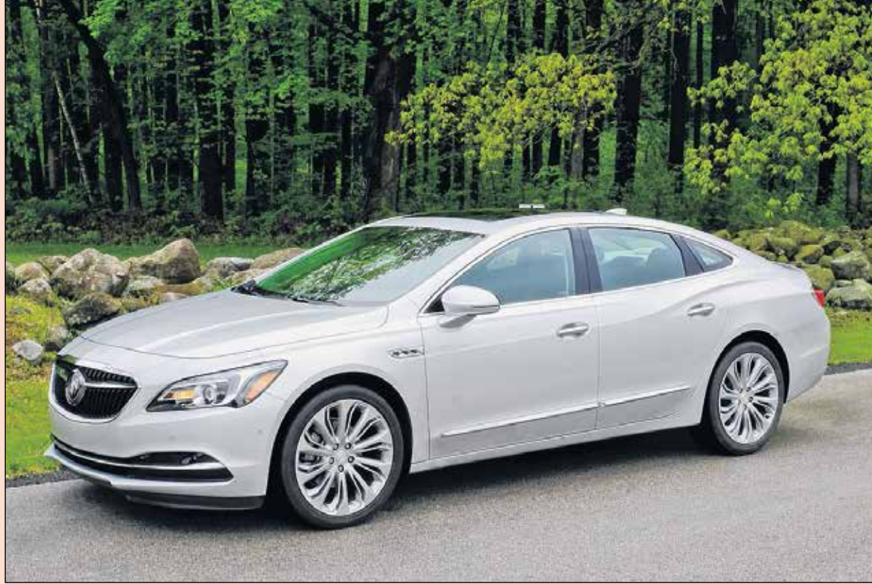
BUICK'S LACROSSE full-size, upscale sedan returns longer, wider and more handsome than the previous model. All four trims levels are powered by a 3.6L V-6 with 310 horsepower. Premium models offer an all-wheel-drive option.

wheelers rate 20/29 (vs. 17/26 last year).