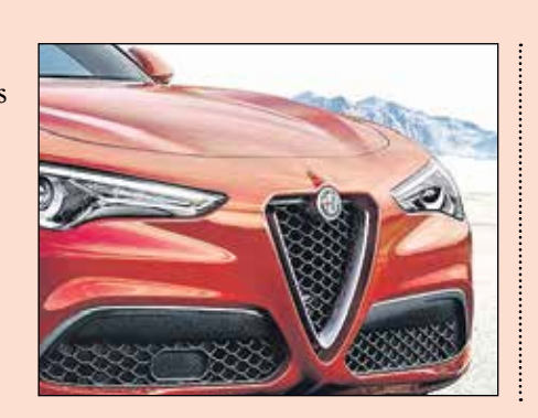
Don't get stranded Is your car ready for that summer road trip? PAGE 3

Alfa wagon The Stelvio stakes its own claim to the segment. PAGE 2