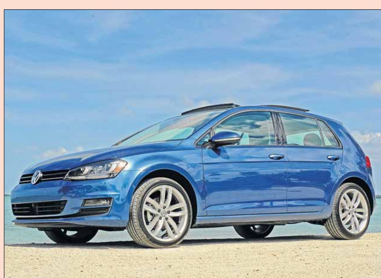
VOLKSWAGEN HAS STREAMLINED both the design and lineup of body styles for the Golf TSI. Both S and Wolfsburg editions are available only in four-door versions, powered by a 1.8L TSI four-cylinder turbocharged engine.