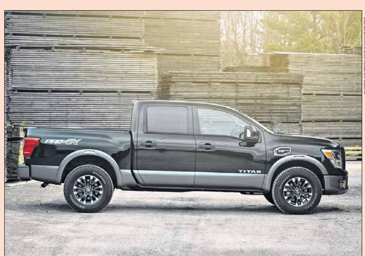
THE NISSAN TITAN PRO-4X is Titan's mid-level trim. This class may be used for hauling, towing and working, but they're just as likely to be daily drivers that just happen to have a box in back.