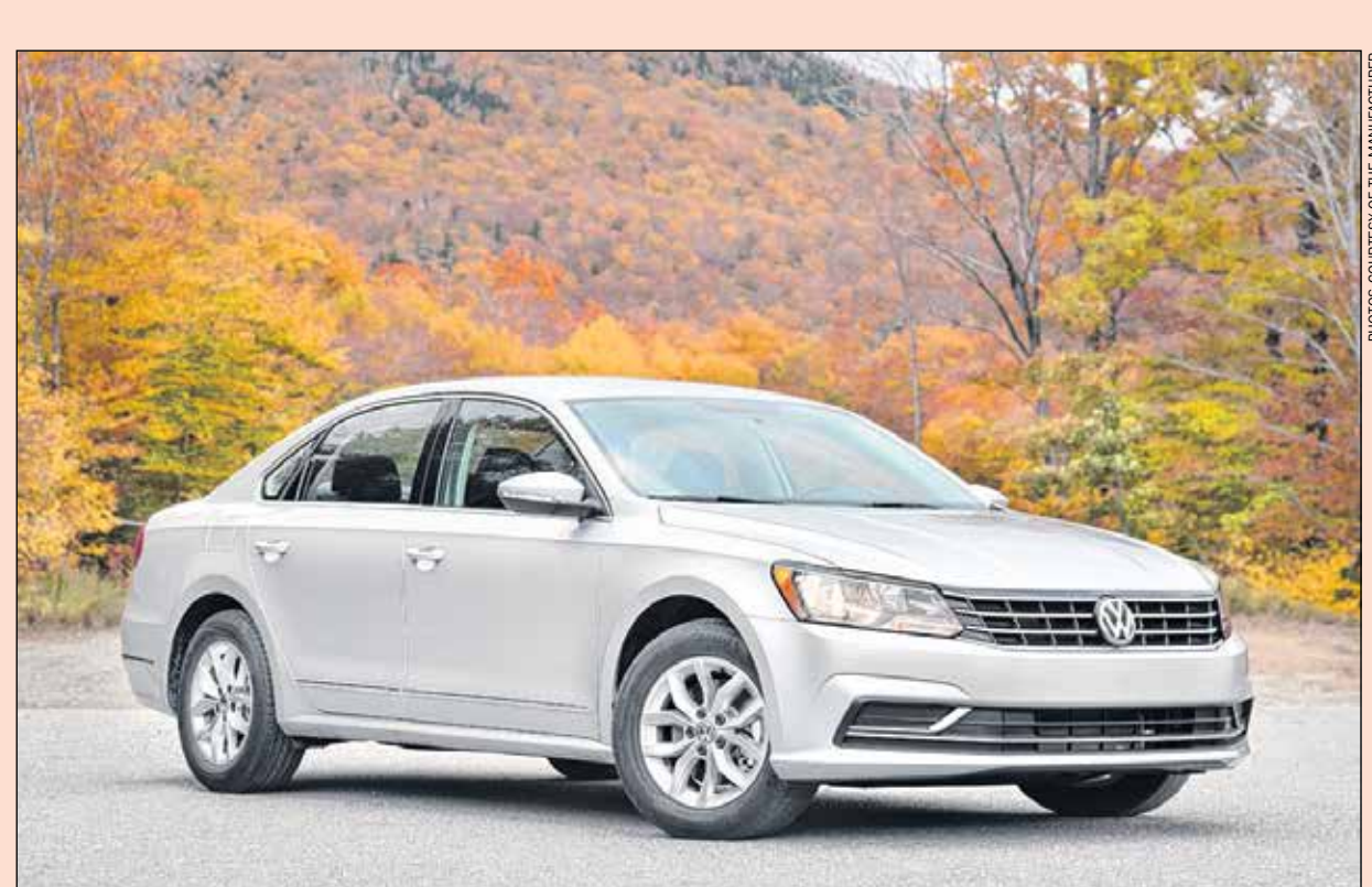
THE PASSAT is Volkswagen's mid-sized sedan, with a segment-leading spacious rear seat, including separate air vents and heated seats. Last year's makeover gave Passat a crisper front view, with tapered headlamps and a four-bar grille.