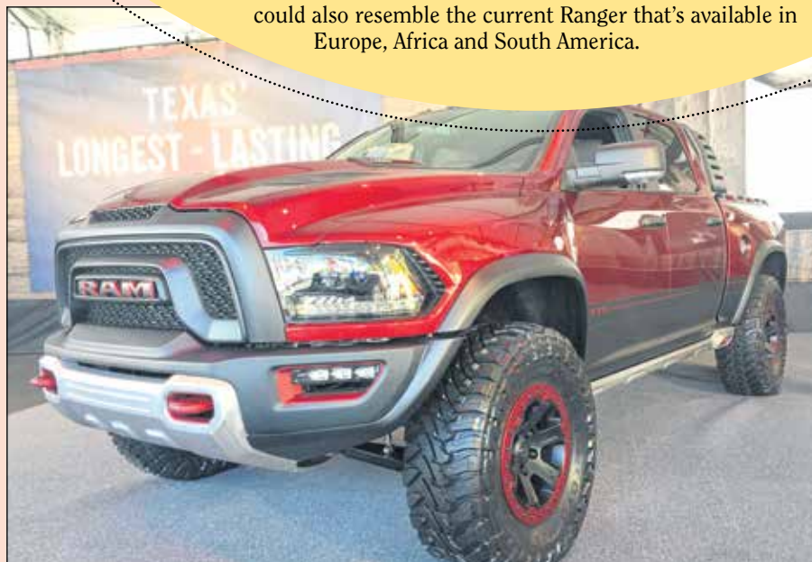
The Ram TRX concept was unveiled last October at the Texas State Fair in Dallas, of course.

before playing the Royal Oak Music Theatre in Detroit. These peach-colored pages say: It's not as crazy an idea as it sounds. With carmakers eager to entice Millennials with the latest Internet-connected goodies, why not tempt them with a little low-tech moral goodness? And electric models usually attract a more eco-conscious buyer, anyway. GM wouldn't be the first. Boutique electric automaker Tesla already offers an all-vegan Ultra White interior option in its Model X SUV, a feature said to be a preference of CEO Elon Musk. For the present, GM only offers animal-product leather in its interiors, but we'll wait for Mary Barra's response to see if that changes.