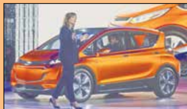
Will Mary Barra heed Morrissey's advice and offer a vegan Chevy Bolt?

If you recall the '80s at all, you remember Smiths' lead singer Morrissey wearing his heart on his sleeve to an almost cringe-worthy extent. Still pumping out the hits in Britain and currently on a U.S. tour, Morrissey (that's it, just Morrissey... like Cher) recently penned an open letter to General Motors CEO Mary Barra urging the automaker to begin offering vegan (non-animal based) leather upholstery in its vehicles.