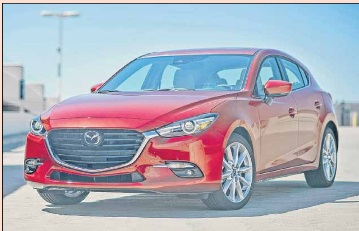
As Mazda's front-wheel-drive compact, the 2017 Mazda3 is offered in four-door sedan or five-door hatchback body styles. Sport and Touring four-doors are equipped with a 2.0L four-cylinder engine (left).