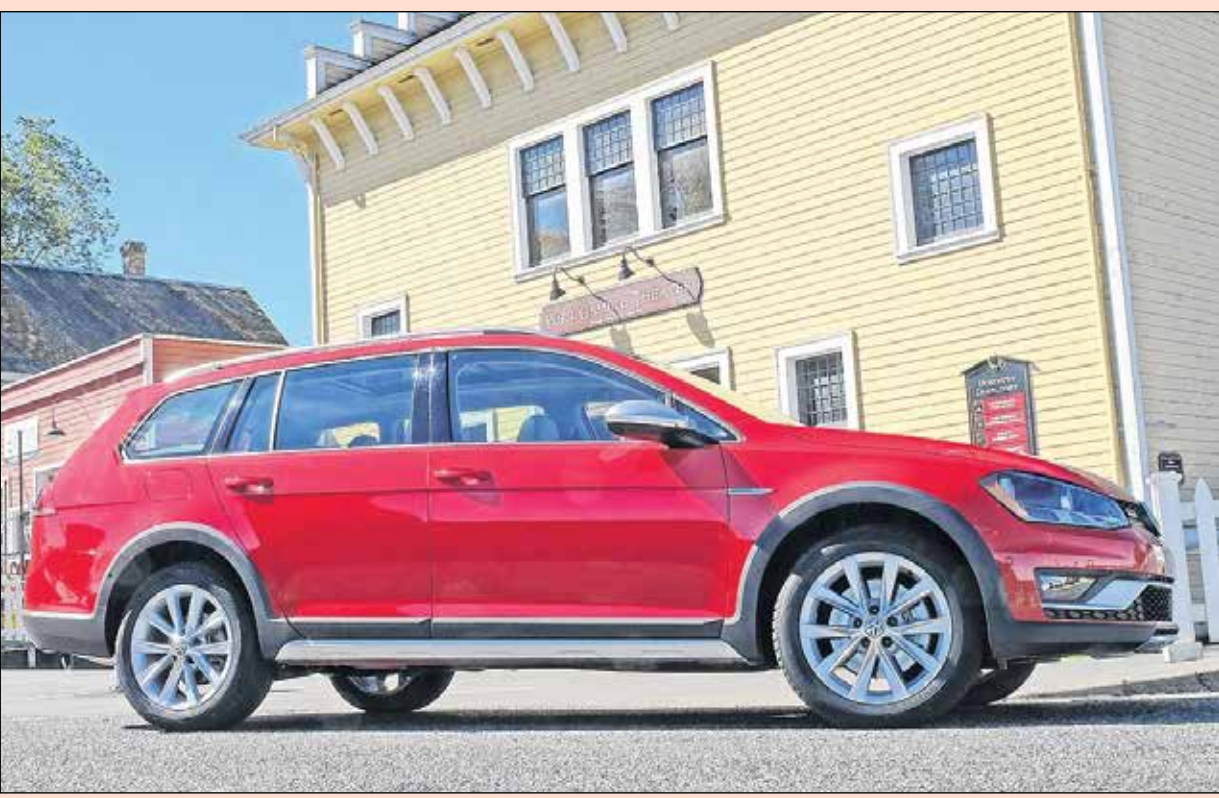
Based on the Volkswagen SportWagen, the 2017 Golf Alltrack is raised and ruggedized for rugged outdoorsy people and those who just want to tackle snow. VW's 1.8L turbo four (left) provides the power, but more engines will follow.

A six-speed manual will join the lineup as the standard transmission on S/SE starting in early 2017. EPA fuel economy is estimated at 22 mpg's city and 30 highway with the DSG automatic.