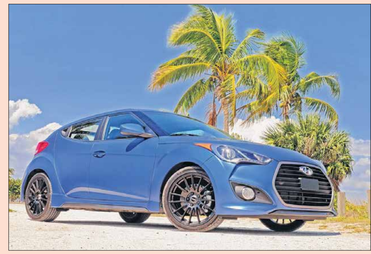
The 2016 Hyundai Veloster Rally Edition is based on the sporting, Turbo R-Spec Velosters. As a limited edition, the company says that the planned production run will not exceed 1,200 units.