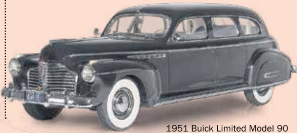
1951 Buick Limited Model 90

It's a full week for car shows in the Capital Region. PAGE 3